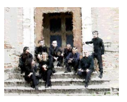
An Italian Ensemble for the Italian musical tradition!